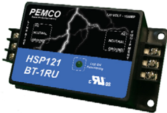
NEMA 4X MODEL SHOWN

The PEMCO HSP-121 Series is an advanced 3-stage hybrid, solid state power line protector. Features such as noise filtering, common mode and normal mode suppression, nanosecond reaction time, power line tracking, and compression screw terminations make the HSP-121 Series an excellent choice in commercial and industrial applications.