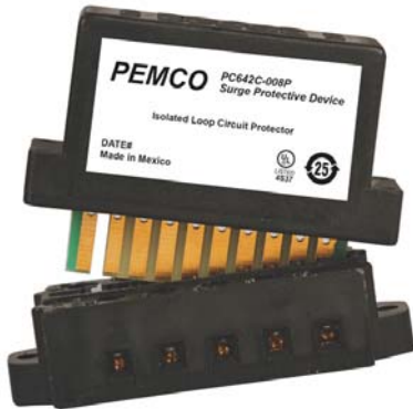
ACCESSORY SOLD SEPARATELY

The PEMCO PC642C Series surge protective device (SPD) is a two-pair (four wire) module implementing three-stage hybrid technology. This SPD addresses over-voltage transients with gas tubes and silicon avalanche components. In addition, sneak and fault currents are mitigated with resettable fuses (PTCs). The PTCs increase resistance several orders of magnitude when over-currents exceed safe levels. A normal state resumes when over-currents are removed. The ability to self-restore in this manner significantly increases suppressor performance and survivability.