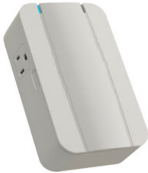
ACCESSORY SOLD SEPARATELY

The PMD2 series wall mount suppressor is designed to protect 120 volt electronics with up to 15 amps current carrying capability. PMD2 has outlets on the sides (90 degree angle from one another) to accommodate a variety of plugs.