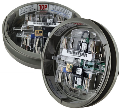
ACCESSORY SOLD SEPARATELY

The SS320 meter base surge protector is your first line of defense against incoming transient surges attempting to enter a home. It has a low profile design and can be installed on up to Class 320 (320 amp) residential and commercial single phase meter enclosures.